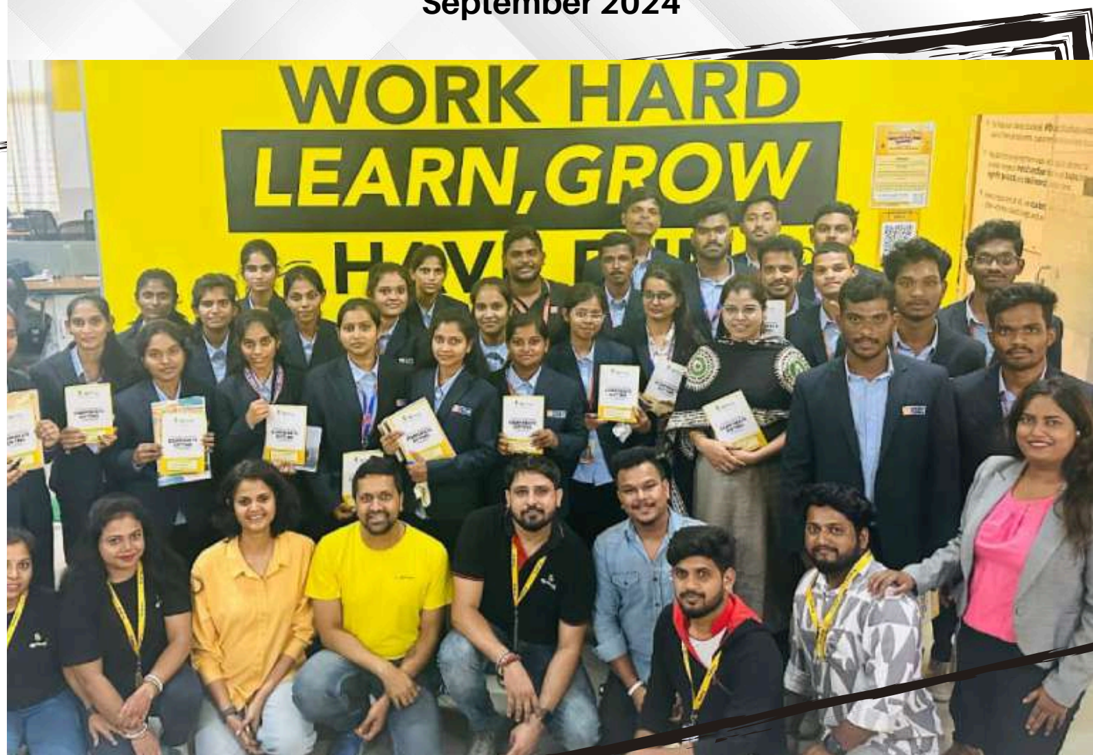
In Pic: MBA students visit OffiNeeds, a corporate gifting company as part of Industrial visit