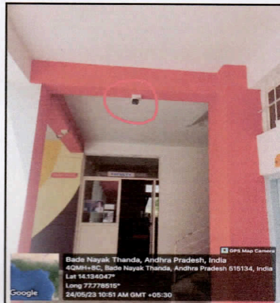
Fig: CC TV cameras inside class rooms and corridors