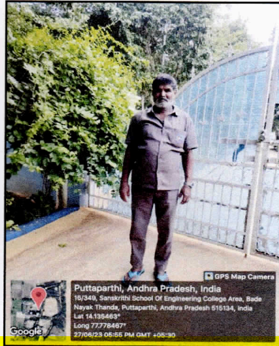
Fig: Hostel Security Guard in SSE Campus