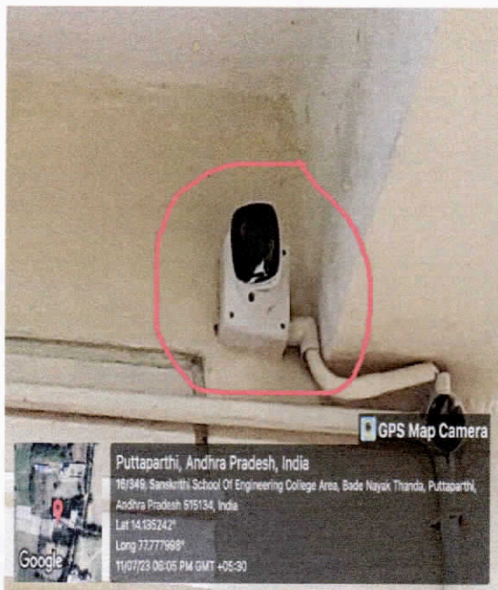
Fig: CC TV cameras at SSE Hostels