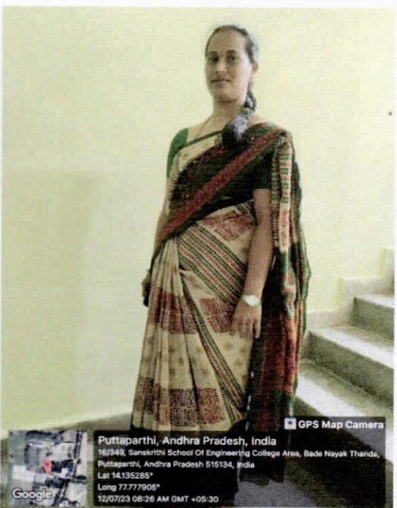
Fig: Girls Hostel Female Warden and Supervisor