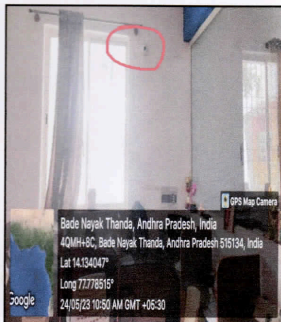
Fig: CC TV cameras at Staff Rooms and corridors