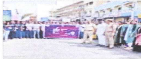
ర్యాలీ నిర్వహిస్తున్న విద్యార్థులు