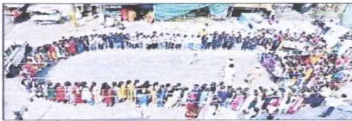
మానవహారంగా ఏర్పడి నినాదాలు చేస్తున్న విద్యార్థులు