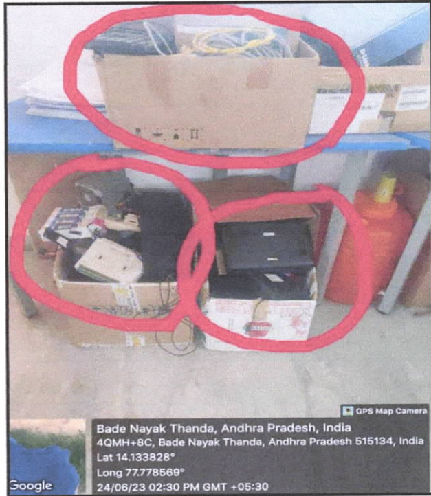
Fig: Collected E-waste from the entire Department and stored in store room for safe disposal.