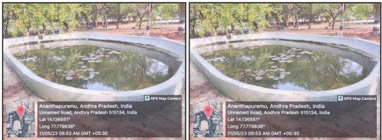
Fig: Harvestable rain water tank bunds near SSE Canteen

Regarding the tank specifications, the tank at Sanskrithi School of Engineering measures 10 meters by 10 meters in size, offering ample capacity to store water resources. The tank bund has a capacity of 150,000 liters (150 KL), ensuring sufficient water storage for various purposes on campus. The cost of constructing the tank bund is estimated at 1 Lakh.